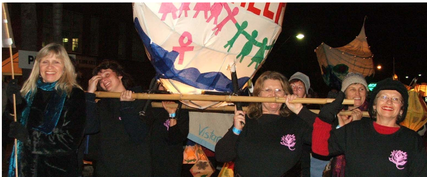
Centre staff & management celebrating 'Journey into Myth' at the Lismore Lantern Parade Winter Solstice 2006